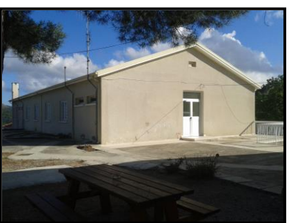
Agros village www.agros.org.cy

Agros is a village in Limassol district, built amphitheatrically among high mountains. Its population is 800 people and it is one of the most interesting villages in Cyprus and Pitsillia area. Historical and cultural sites are kept in a natural environment of extraordinary beauty with the village maintaining the customs and its traditional character. The love for work and the progressiveness characterise its inhabitants. The village's modern roads make it a connection point between the cities of Nicosia and Limassol and the mountain of Troodos. Its main production line consists of grapes, garden products, fruit of excellent quality, soutzoukos, traditional type smoked products (sausages, lountza, choiromeri), traditional sweets and marmalades. Its inhabitants are also into tourism business (hotels, tourist apartments, inns, traditional coffee shops, taverns and bars.)