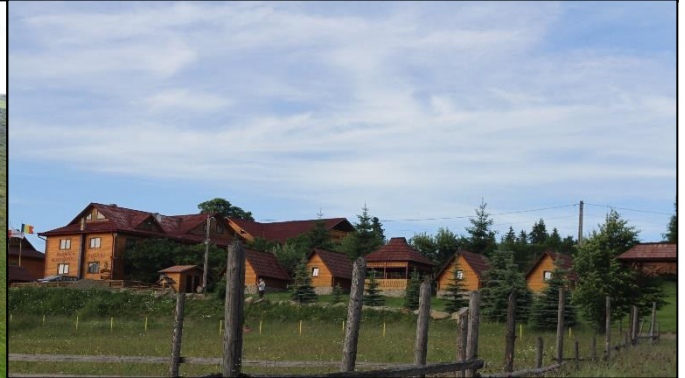
All photos were taken by participants in our projects in 2014-2016, without editing ☺