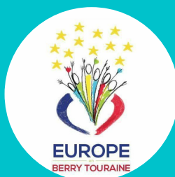
EUROPE BERRY TOURAINE FRANCE