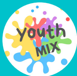
YOUTH MIX ARMENIA