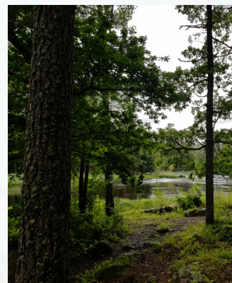
Färnebofjärden National Park, nearby our course venue