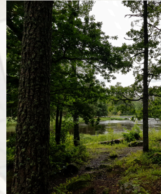
Färnebofjärden National Park, nearby our course venue